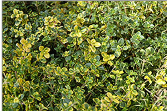
Doone Valley Thyme