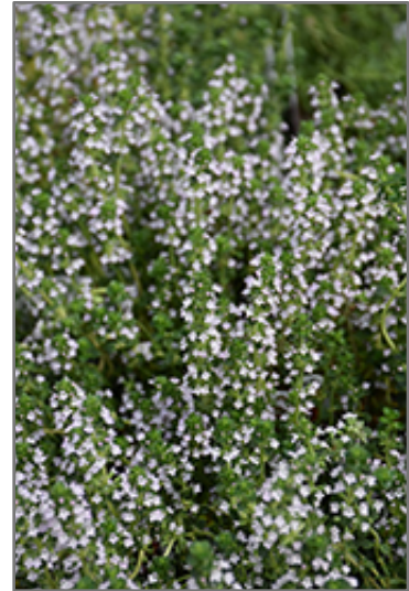
Doone Valley Thyme flowers

This plant will require occasional maintenance and upkeep, and is best cleaned up in early spring before it resumes active growth for the season. Deer don't particularly care for this plant and will usually leave it alone in favor of tastier treats. Gardeners should be aware of the following characteristic(s) that may warrant special consideration;