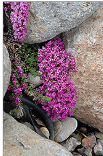
Pink Chintz Creeping Thyme in bloom

This plant should only be grown in full sunlight. It prefers to grow in average to dry locations, and dislikes excessive moisture. It is considered to be drought-tolerant, and thus makes an ideal choice for a low-water garden or xeriscape application. It is not particular as to soil type or pH. It is highly tolerant of urban pollution and will even thrive in inner city environments. Consider covering it with a thick layer of mulch in winter to protect it in exposed locations or colder microclimates. This is a selected variety of a species not originally from North America. It can be propagated by division; however, as a cultivated variety, be aware that it may be subject to certain restrictions or prohibitions on propagation.