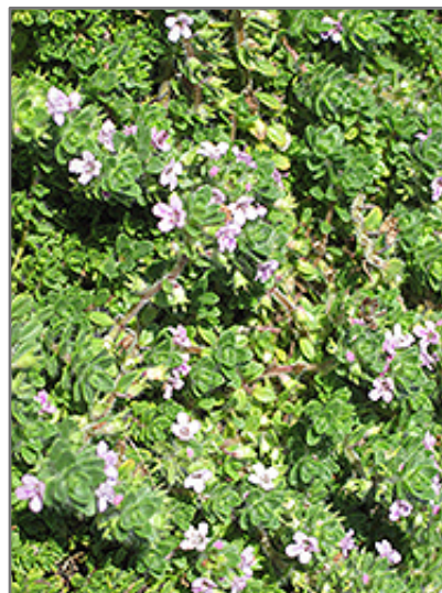
Pink Chintz Creeping Thyme flowers