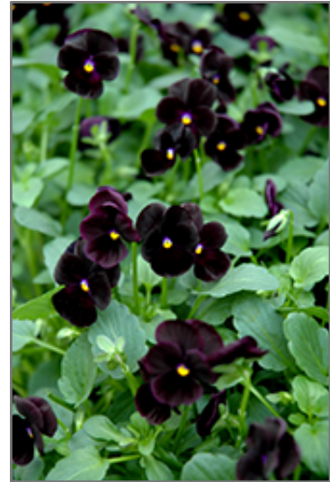
Sorbet Black Delight Pansy flowers

This plant will require occasional maintenance and upkeep, and should only be pruned after flowering to avoid removing any of the current season's flowers. Deer don't particularly care for this plant and will usually leave it alone in favor of tastier treats. Gardeners should be aware of the following characteristic(s) that may warrant special consideration;