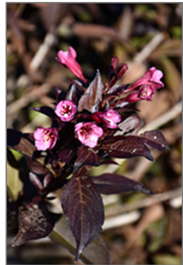
Fine Wine Weigela flowers