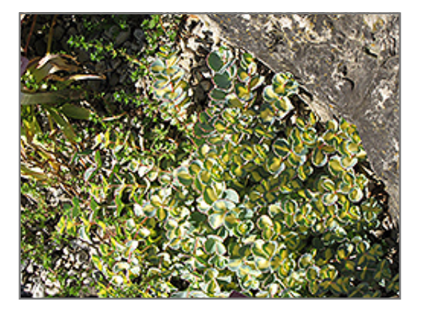
Variegated October Daphne in bloom

This variety is useful and beautiful at the front of a border, along the edge of a walkway or tucked into a rockery or wall crevices; also excellent for container plantings; striking blue-green leaves with contrasting yellow variegation puts on a show