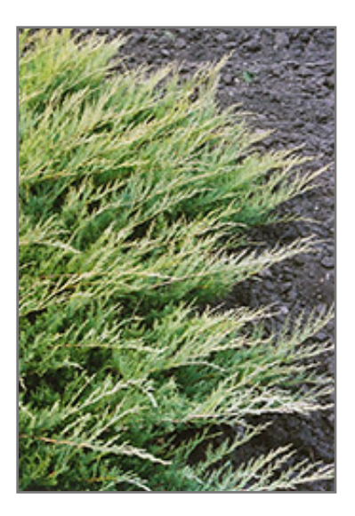
Broadmoor Juniper foliage