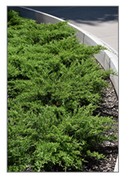
Broadmoor Juniper