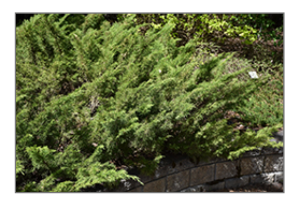
Skandia Juniper

Skandia Juniper is recommended for the following landscape applications;