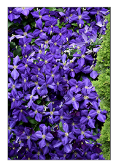
Jackmanii Clematis in bloom