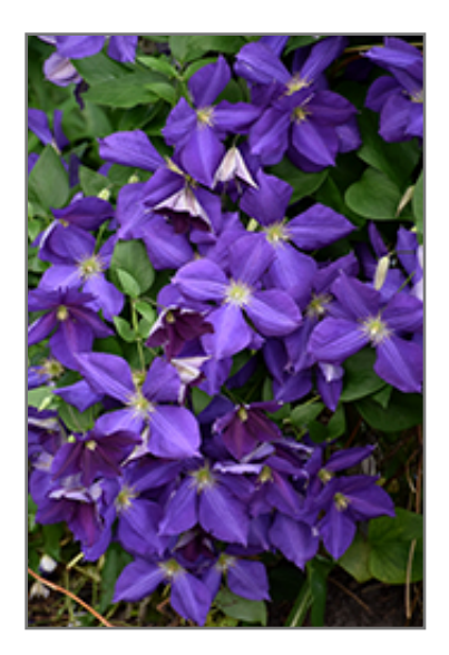
Jackmanii Clematis flowers