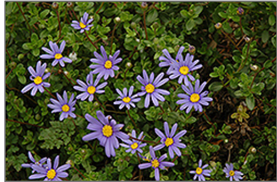
Blue Daisy flowers