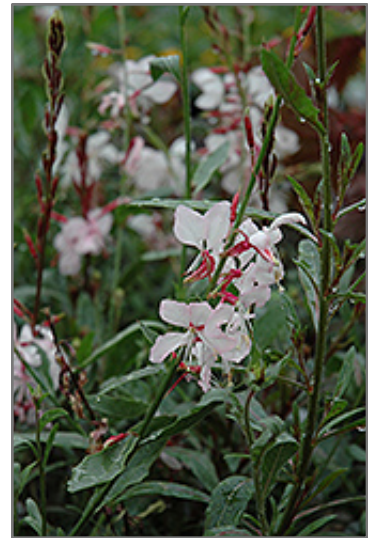
Ballerina Blush Gaura flowers

This is a relatively low maintenance plant, and is best cleaned up in early spring before it resumes active growth for the season. It is a good choice for attracting butterflies to your yard, but is not particularly attractive to deer who tend to leave it alone in favor of tastier treats. It has no significant negative characteristics.