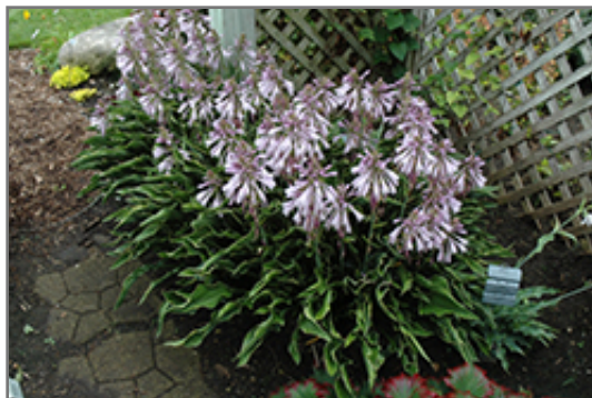
Praying Hands Hosta in bloom

Praying Hands Hosta is recommended for the following landscape applications;