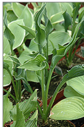
Praying Hands Hosta foliage